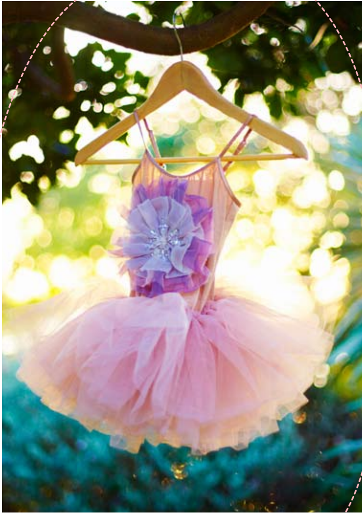
blossom tutu in blush