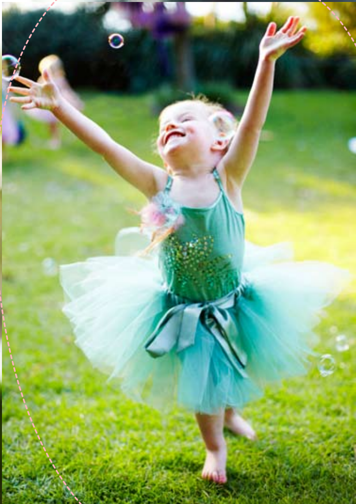
butterfly top with fairy tutu skirt