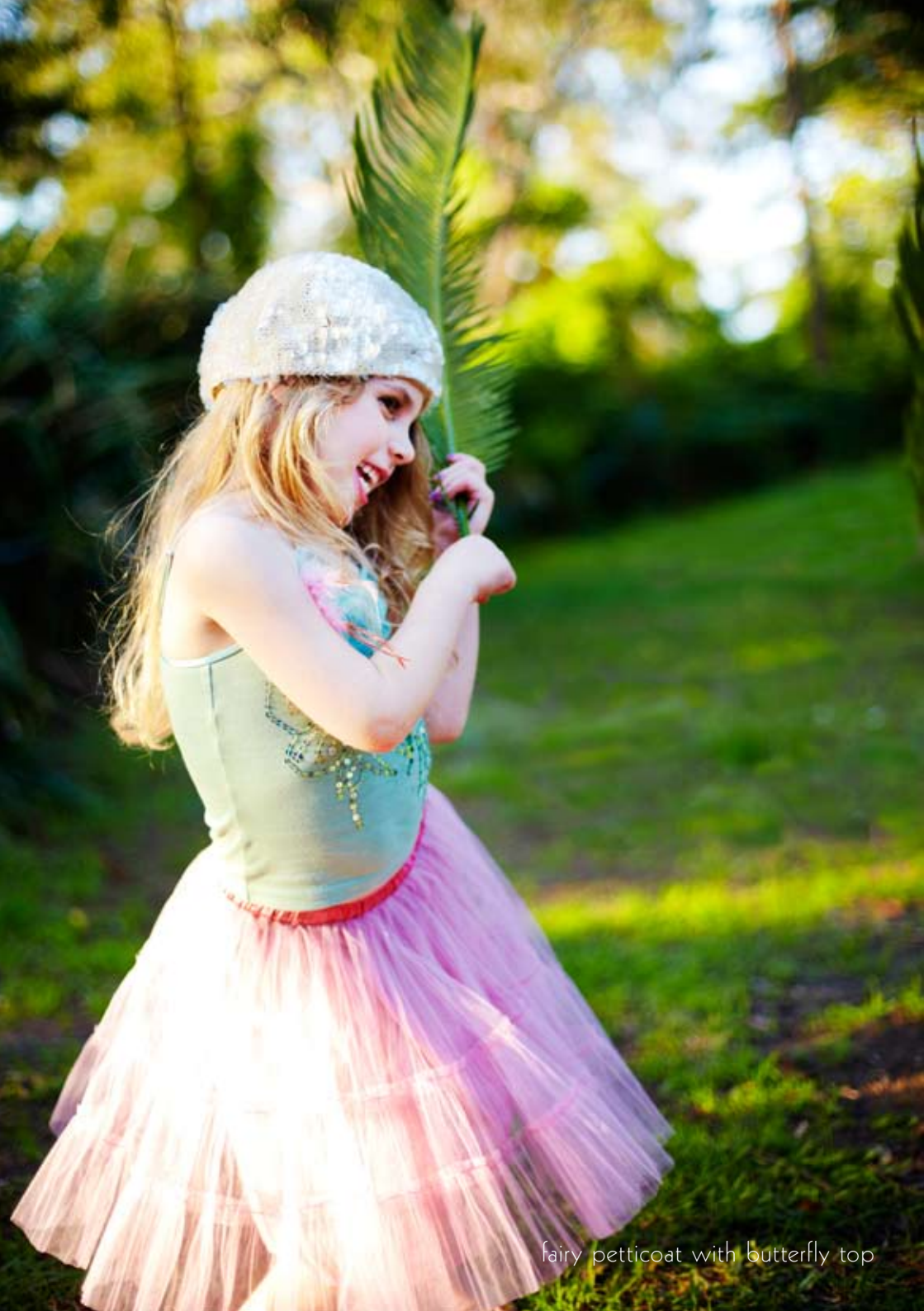
fairy petticoat with butterfly top