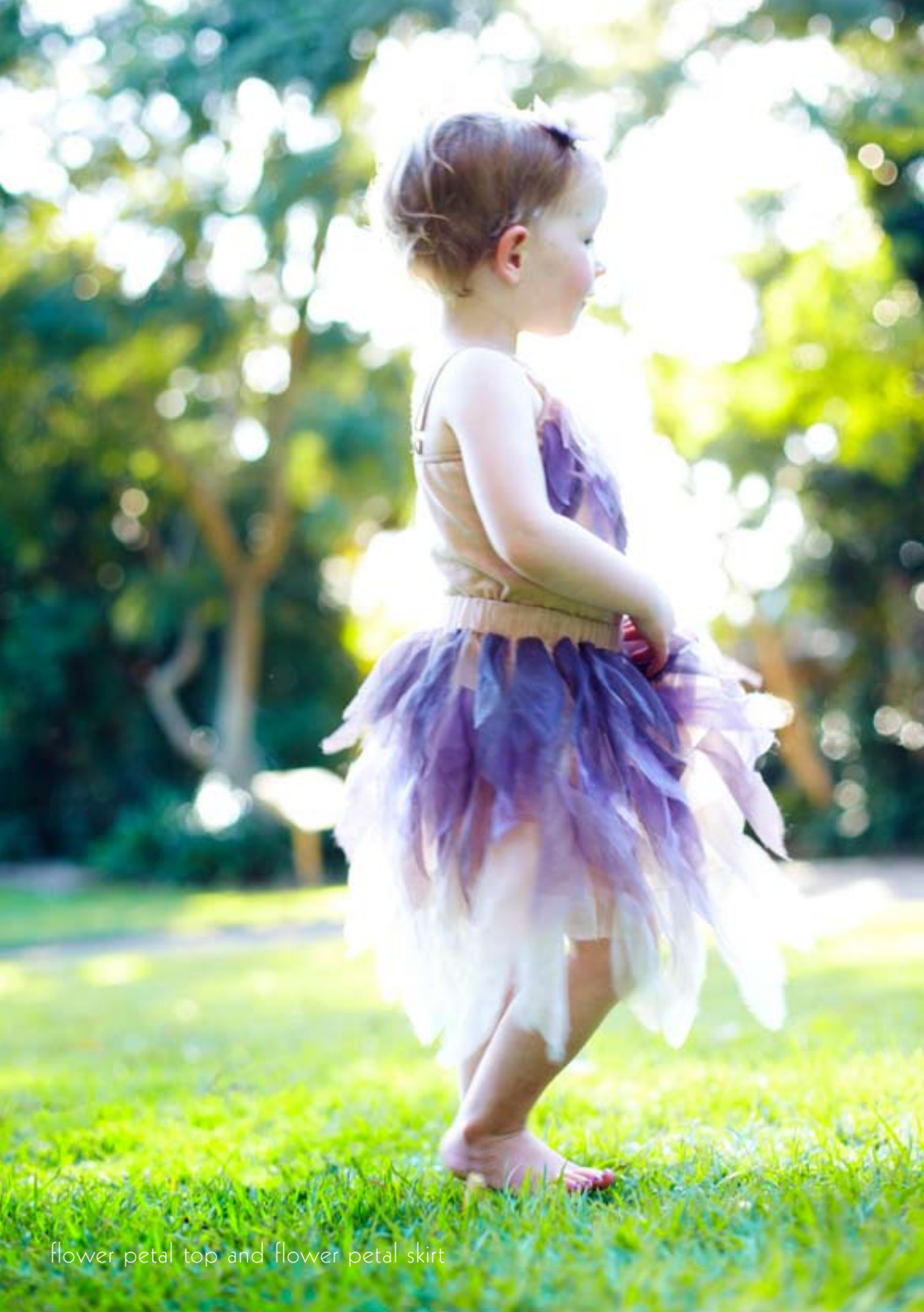
flower petal top and flower petal skirt